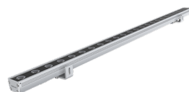
14pcs AS Linear MIDI RGBW