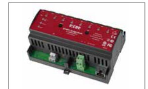
SYMPL Bridge Node

Omega Mart from Meow Wolf is an interactive and immersive art experience located in Las Vegas. Referred to as “Americas Most Exceptional Grocery Store,” Omega Mart is fully stocked with groceries and household items that at first appear to be real but are in fact unreal products. Completed in February of 2021, Omega Mart is the most recent addition to AREA15, a one-of-a-kind entertainment and retail district chock-full of art installations, restaurants, themed events and immersive experiences.