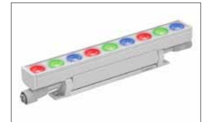
Cove Light AC HO RGB Graze